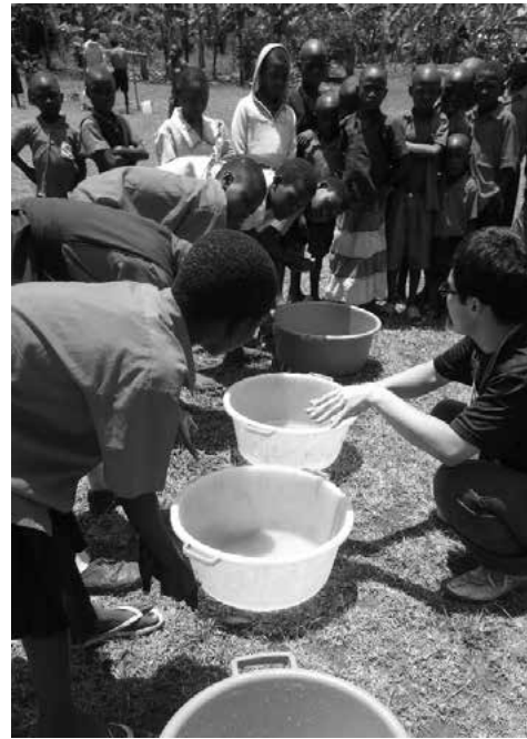
Figure 3. Using Basin (Group B)