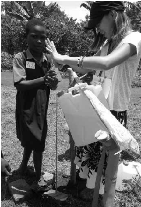
Figure 2. Using Tippy-Tap (Group A)