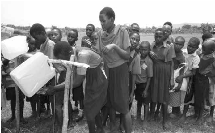
Figure 1. Tippy Tap