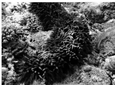
Photo 1 Thelenota ananas .

From what time did the term pineapple sea cucumber spread across the Indonesian